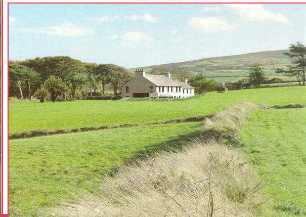
Hillside Farm (Plot) Slieau Whallian Road, St. Johns, IM4 3BJ Asking Price £599,950